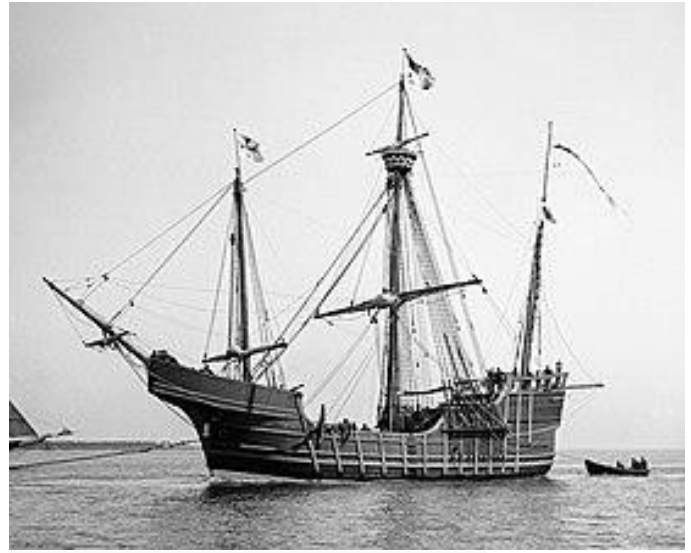
[Replica of the Spanish carrack Santa María. https://en.wikipedia.org/wiki/Santa_Mar%C3%ADa_(ship)]

He sailed from Spain. He had 3 ships. The main one was the Santa Maria. The picture below is a copy of the Santa Maria.