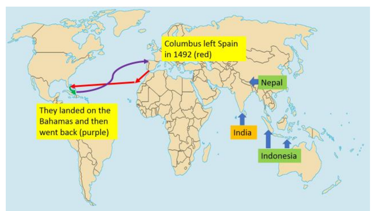
[This map was released into the public domain by its author, Vardion. Many thanks.]