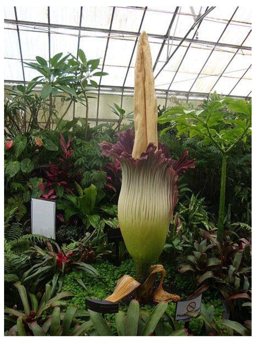
[Titan Arum, Royal Botanic Gardens, Melbourne, Victoria, Australia.]