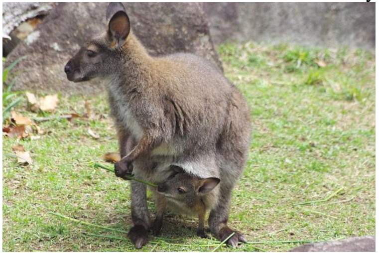
[https://creativecommons.org/licenses/by-sa/2.0/deed.en Attribution-ShareAlike 2.0 Generic (CC BY-SA 2.0)]

Wallabies are also found in Australia – they are like small kangaroos.