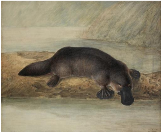
This is a platypus.

A platypus is a very strange animal which is only found in Australia. Its babies come in eggs, but it feeds them with milk. It has fur, but it has a bill and feet like a duck. [It is NOT a sort of a cat.] There are many strange things in life.