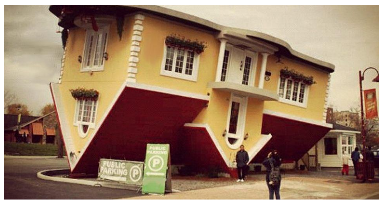
and this one is in Niagara, Canada.