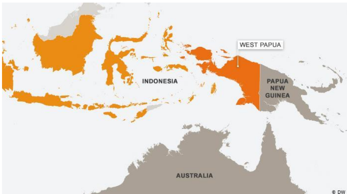
[ https://www.dw.com/en/fighting-for-a-forgotten-cause-in-west-papua/a-16701714 ]

As you know, Hawaii is now part of the country called the United States of America or the USA or the US. When they say US, they don't mean us, like you and me, but, I guess you knew that.