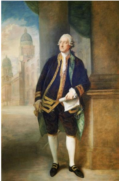
[Public domain. https://commons.wikimedia.org/wiki/File:John_Montagu,_4th_Earl_of_Sandwich.jpg ]

[Just so you know, this is Lord Sandwich, after whom your sandwiches are named.]