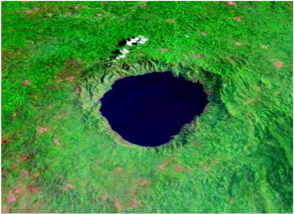
[Wikimedia Commons // Public Domain https://en.wikipedia.org/wiki/Lake_Bosumtwi]

Lake Bosumtwi in Ghana [Africa] – is a crater. It doesn't look like a crater because the meteor landed a very long time ago and it is in the middle of a rainforest, and the plants have covered things up. But, it is quite deep and you can see it is round.