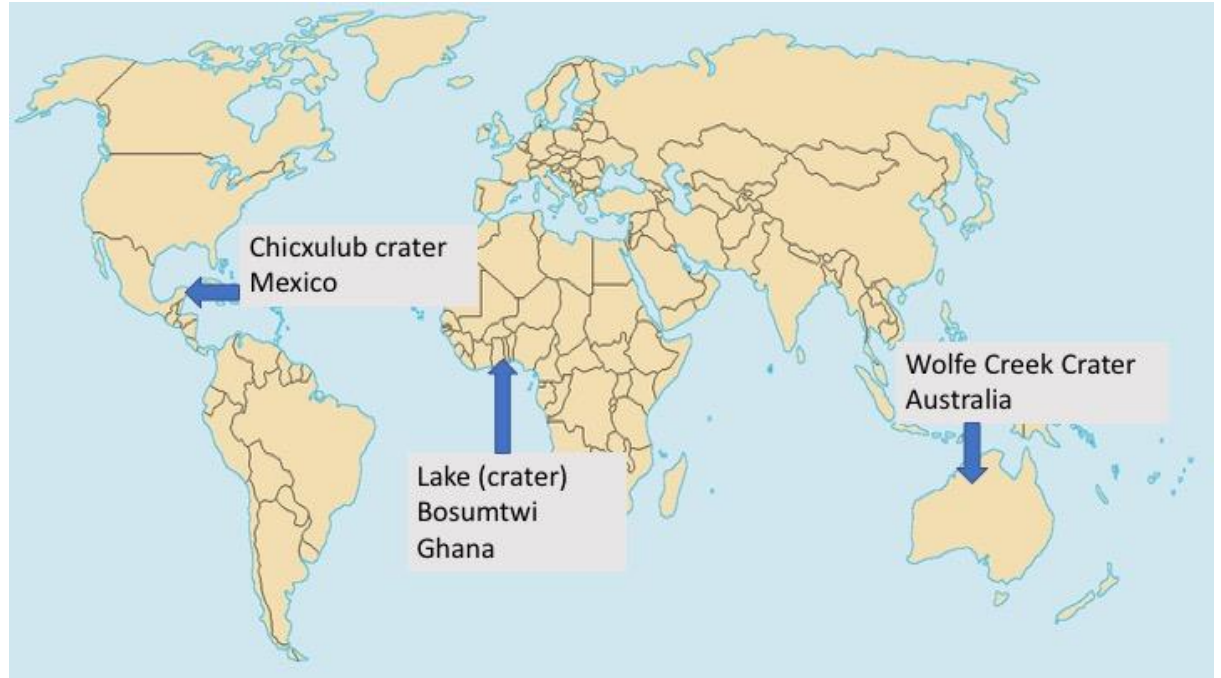
[This map was released into the public domain by its author, Vardion. Many thanks]