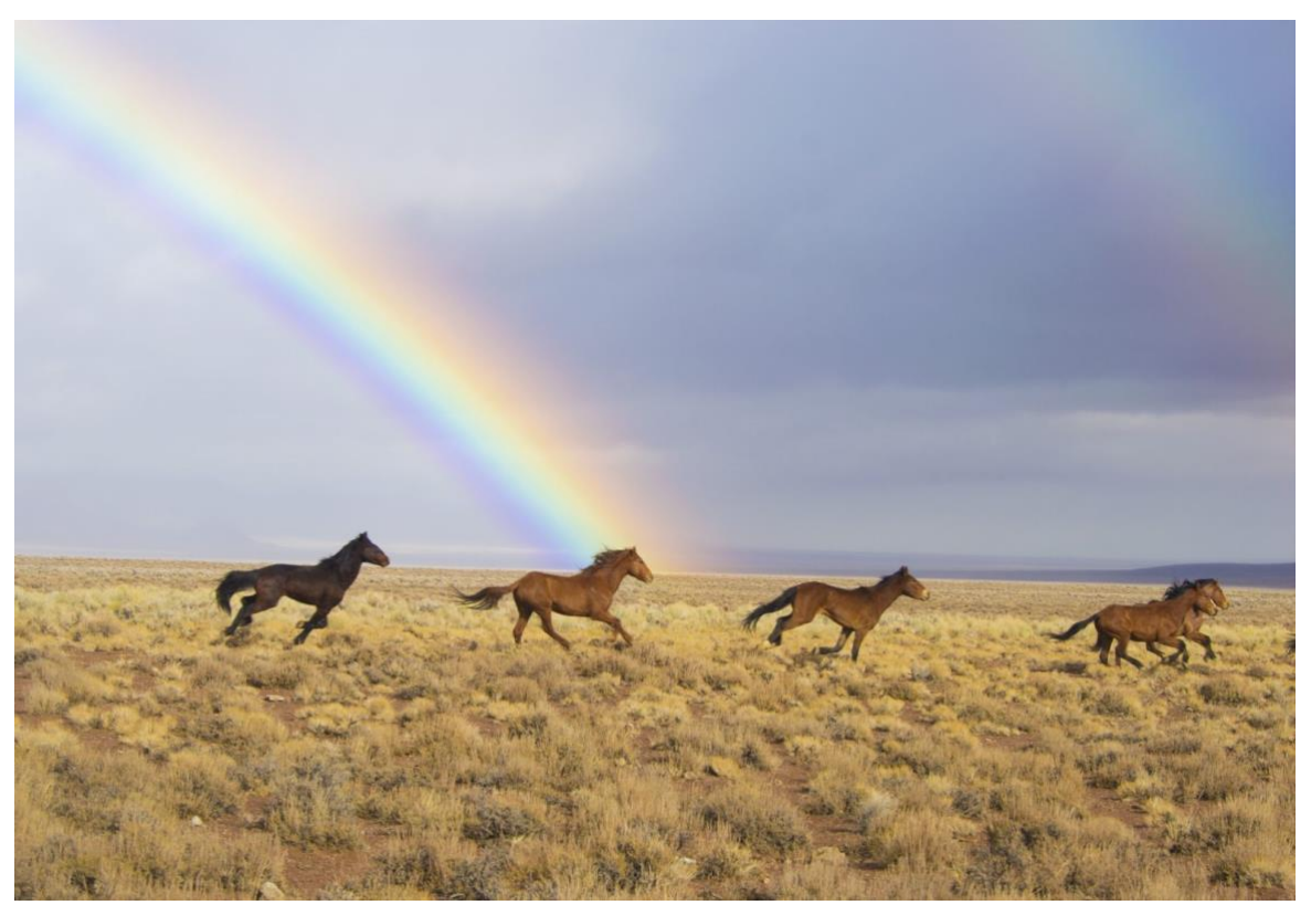
[Clean Public Domain. Many thanks.]