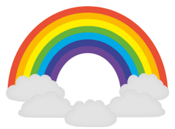
[Clean Public Domain. Many thanks.]

These pictures are very beautiful. But it is sometimes hard to see all the separate colours - so, let's look at a drawing.