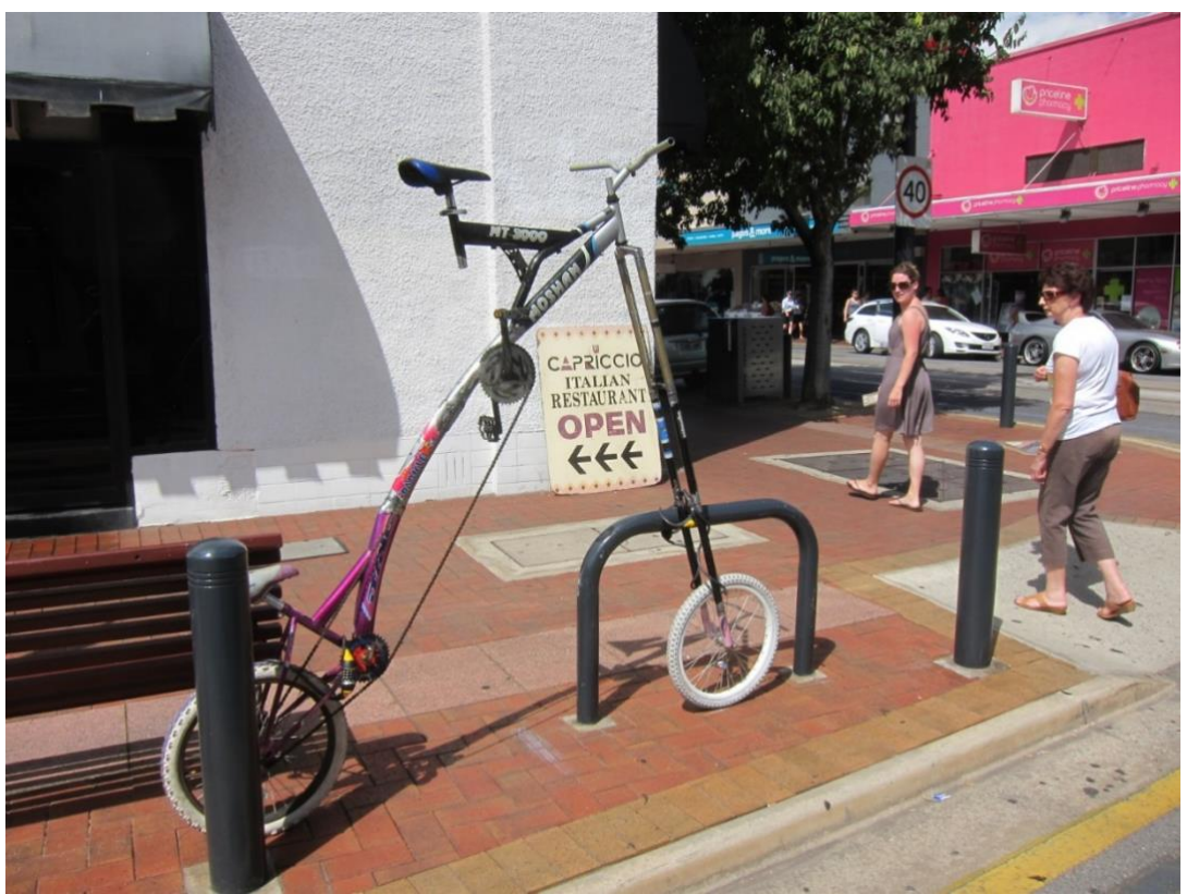
[We can't remember where we found the picture, and will take this picture down if those who took the picture object.]

This is an unusual bicycle, don't you think? There are two seats [one nearly hidden by a black post] and two sets of pedals. Pretty cool!