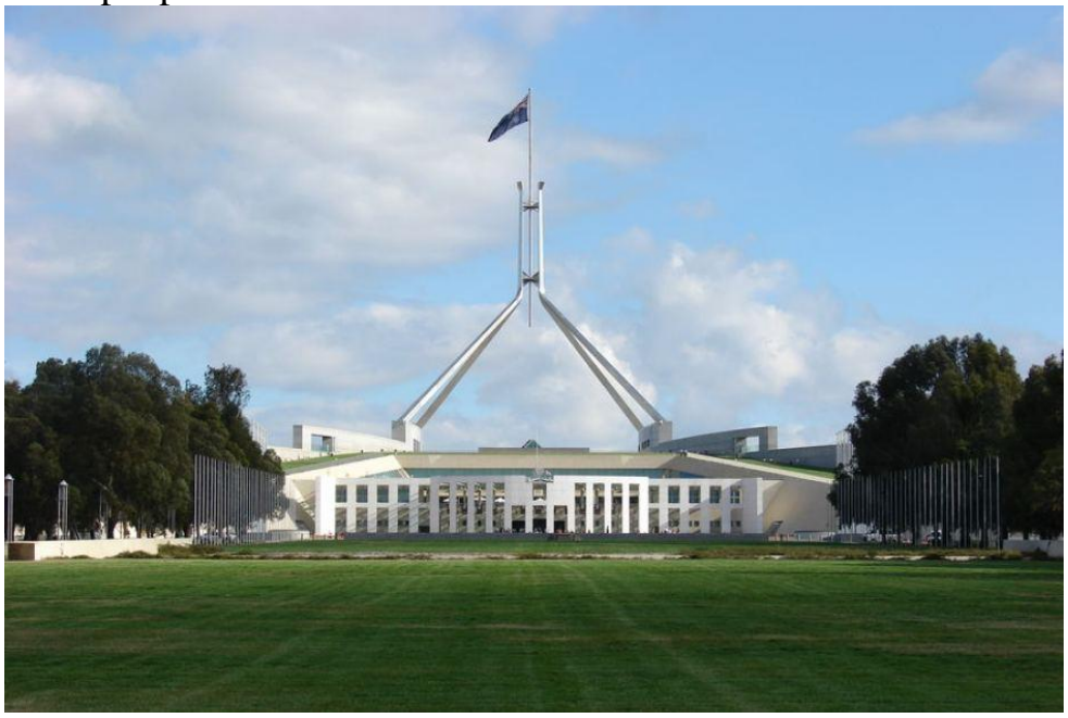
OK, but, where is this Parliament House? Well, it is in a city called Canberra. But, where is this city called Canberra?

This is the Federal Parliament House of Australia, where the Prime Minister and those people who make the laws of Australia do their work.