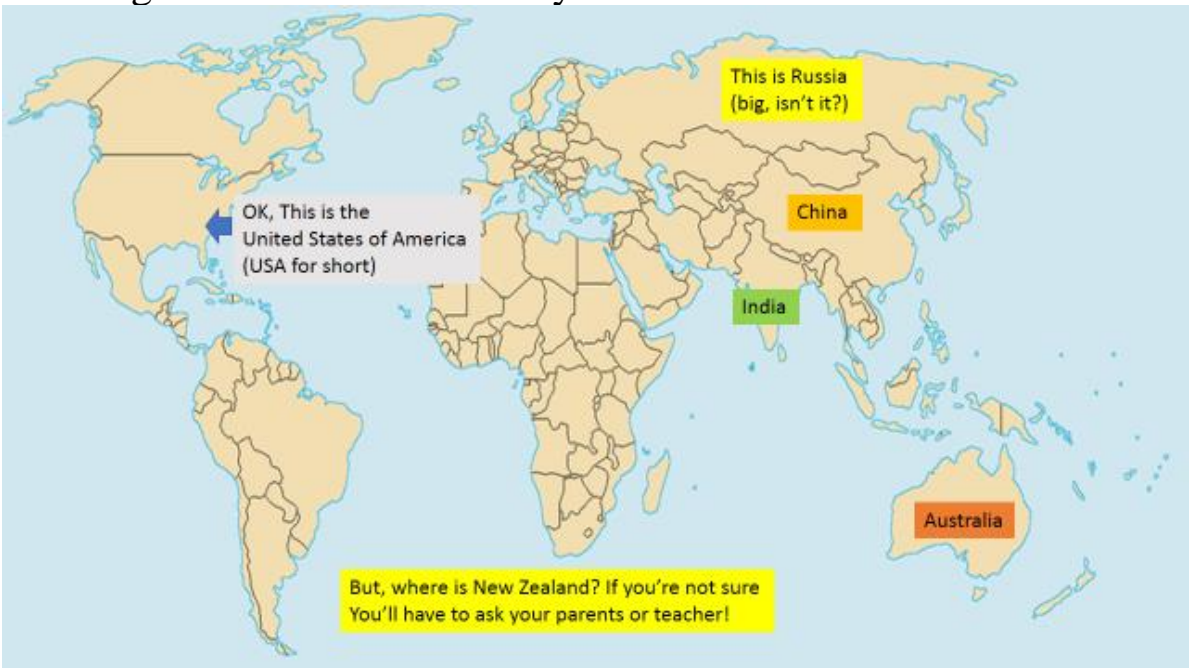
[Map released into the public domain by its author, Vardion – which is very generous.]

OK, this is a map of the world. But, where is New Zealand? You might have to ask somebody.